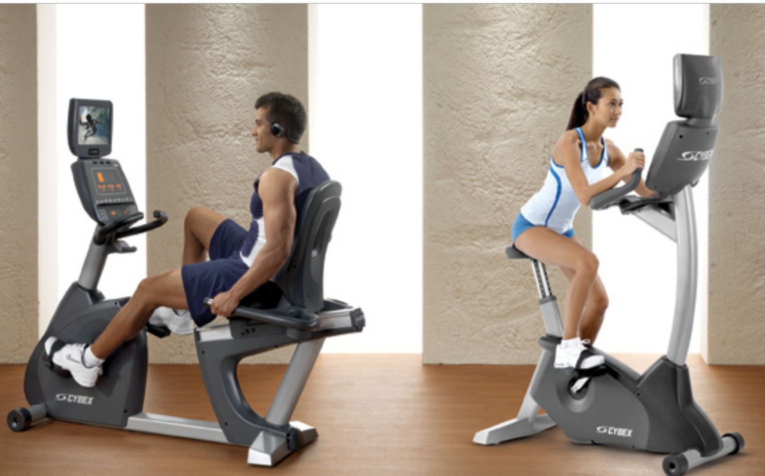
*Shown with optional Personal Entertainment Monitors (PEMs)

The CYBEX 750 series bikes provide distinct and compelling ways to improve your member's fitness experience whether they chose the 750C to train for the triathlon, or the 750R as they begin their journey to better fitness. The CYBEX 750C and 750R Bikes deliver more of what your users demand – from exceptionally low workloads for the beginner to the versatility available in the programming variety and three resistance modes.